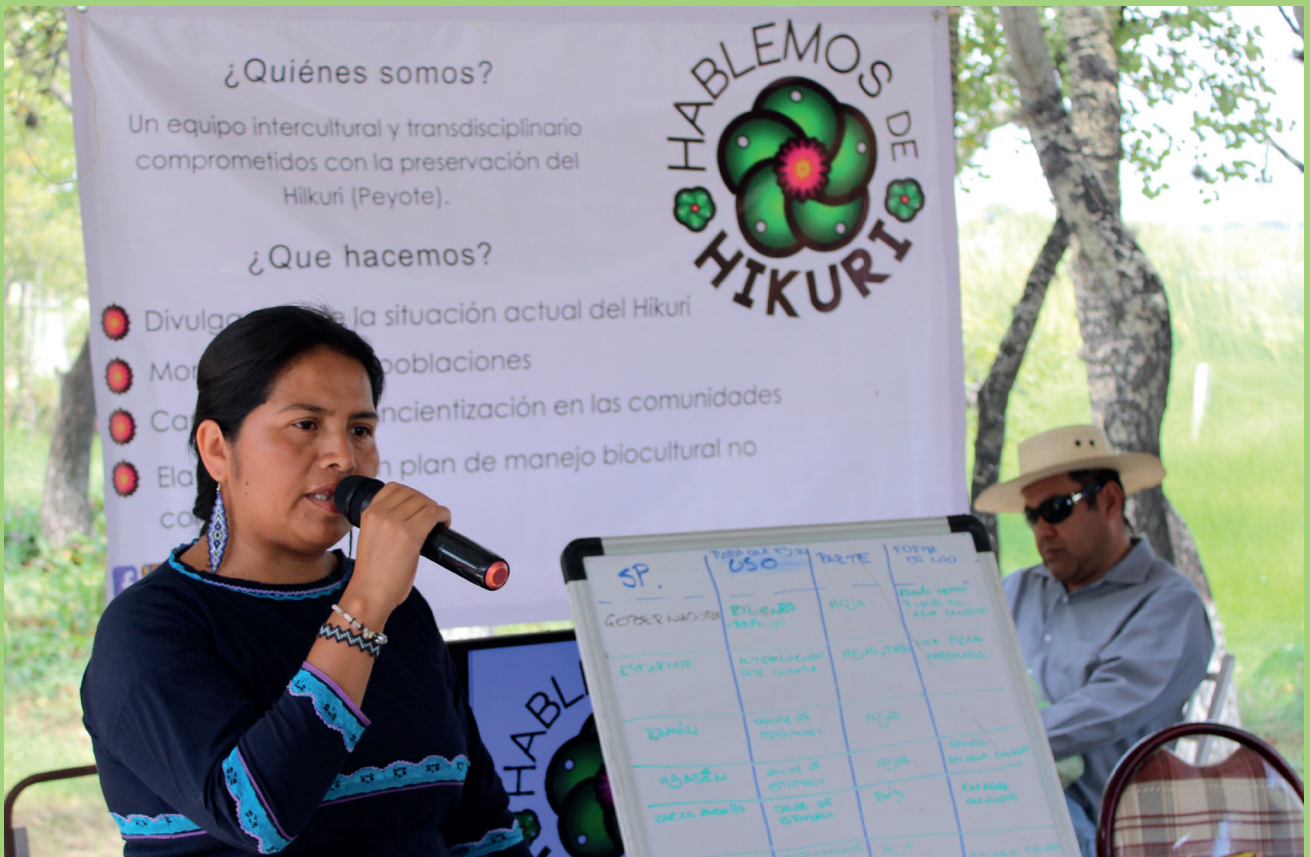
Images of the event "Mitote en el gran tunal" organized by our partners Hablemos de Hikuri, in San Luis Potosi, Mexico.