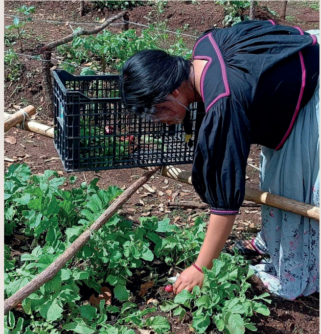
Tamaatsi Páritsika autonomous school