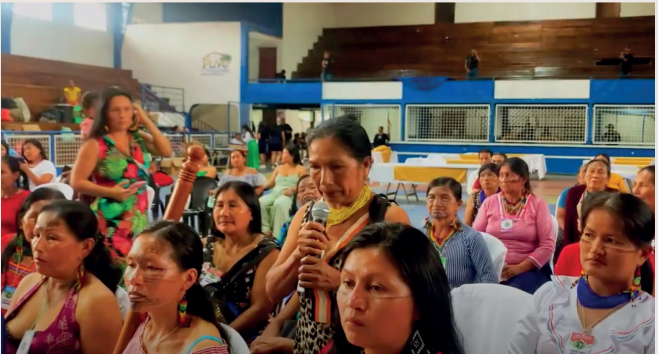
Image of the Chagramanda Shimina event organized by our Ecuadorian partners Sacha Warmi